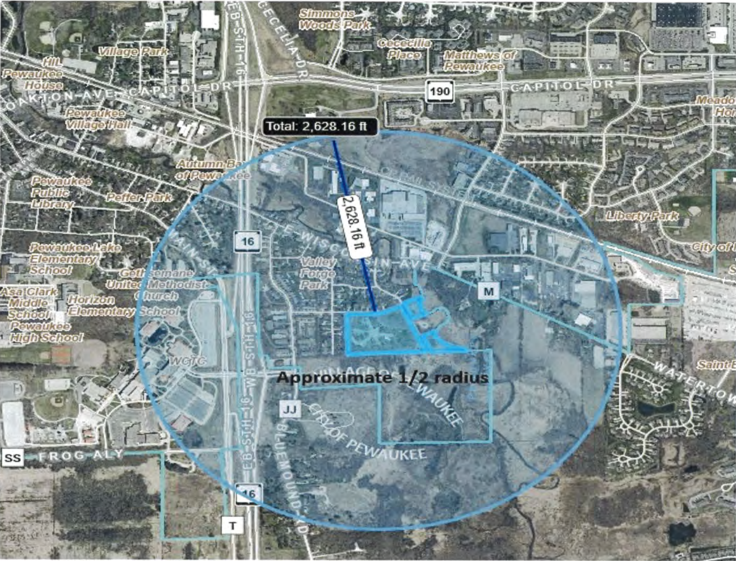
Map Showing Proposed Improvements and Uses with 1/2 mile radius shown