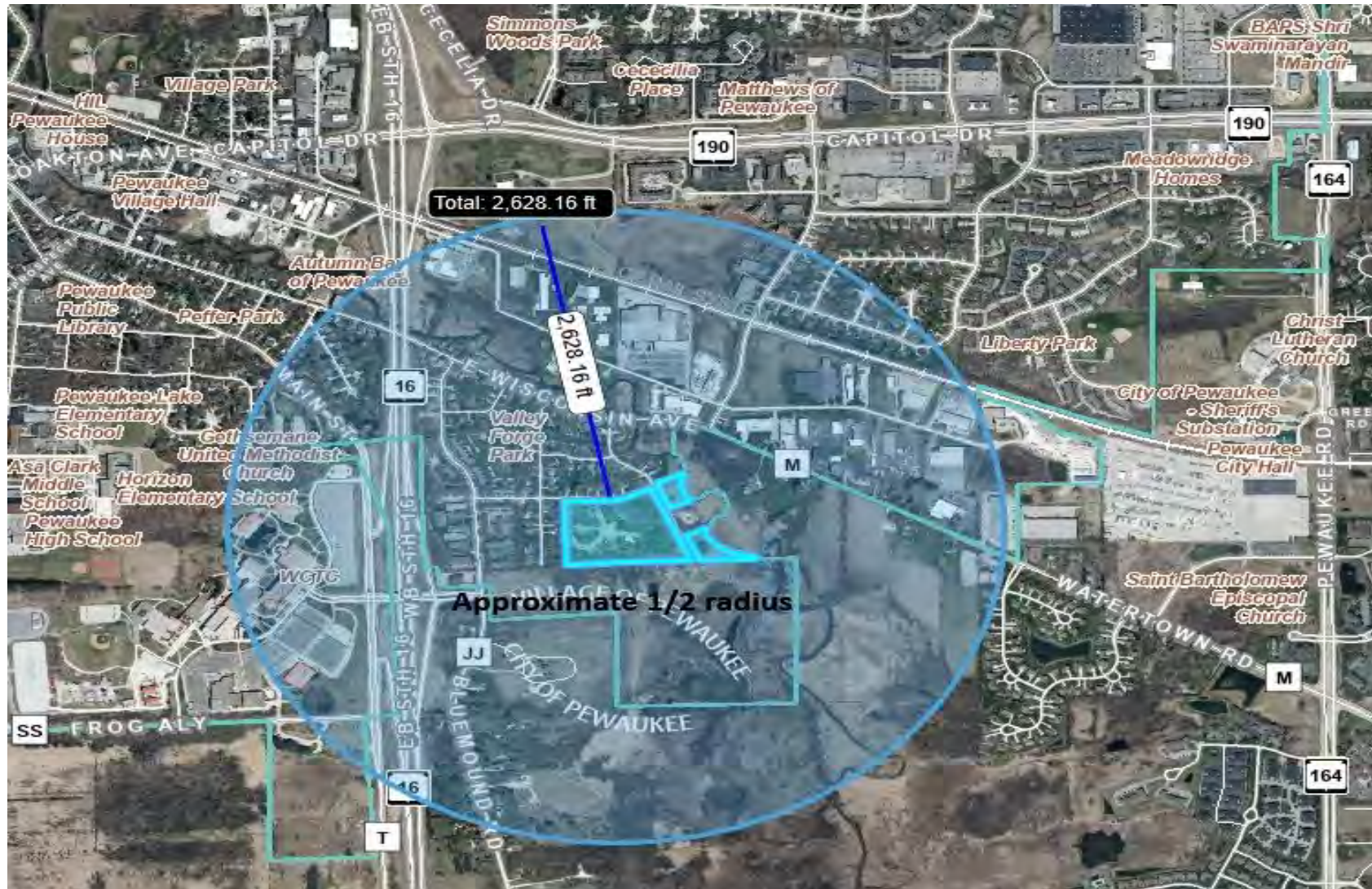
Map Showing Proposed Improvements and Uses with 1/2 mile radius shown