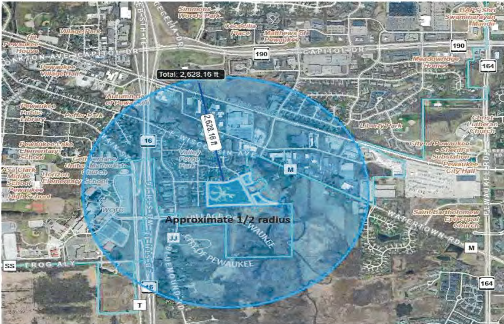
Map Showing Proposed Improvements and Uses with 1/2 mile radius shown